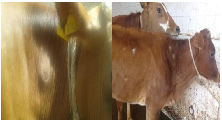
Fig. 5: Side fast appearance on non-vaccinated control animals.