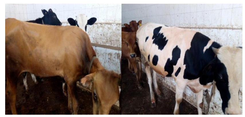
Fig. 6: Vaccinated animals appeared normal without any clinical signs.

Evaluation of cell mediated immune response of vaccinated calves with the prepared vaccines and control non vaccinated calves