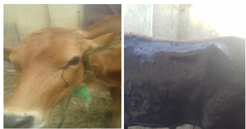
Fig. 3&4: Lacrimation , rise of body temperature and skin eruption in the form of rounded nodules appeared all over the animal body appear on non-vaccinated control animals.

Challenge of all vaccinated and control animals with local virulent strain of LSD virus (neethling strain) showed that 75% of vaccinated animals with the inactivated LSD vaccine prepared by adding ISA 50 adjuvant were protected and 88% of vaccinated animals with inactivated LSD vaccine prepared by adding ISA 206 adjuvant were protected. The protected animals showed no clinical signs of the disease no local or generalized reaction while the control non vaccinated animals and the non-protected animals did not resist the challenge and showed the classical form of lumpy skin disease infection observing rise in temperature and large rounded nodules at the site of inoculation by the 14th day post inoculation and then after 21 days, Lacrimation, skin eruption in the form of rounded nodules appeared all over the animal body with enlargement of the superficial lymph nodes .